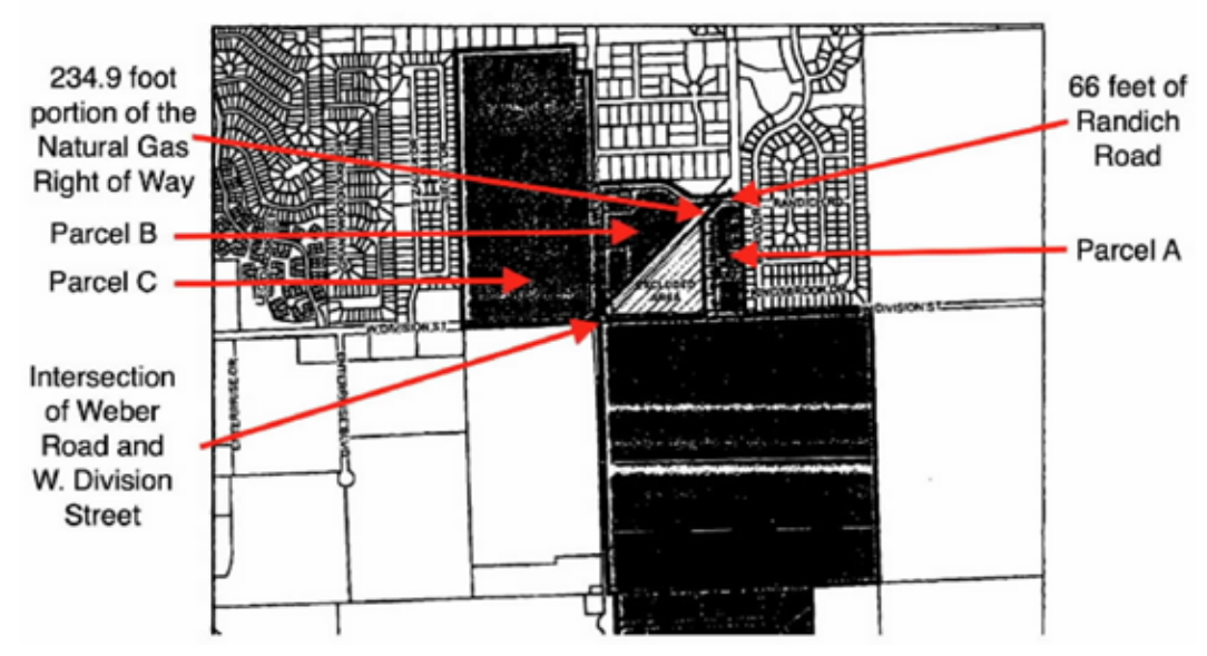
Map 2—Enlarged TIF District Map with Measurements and Highlighted Boundary