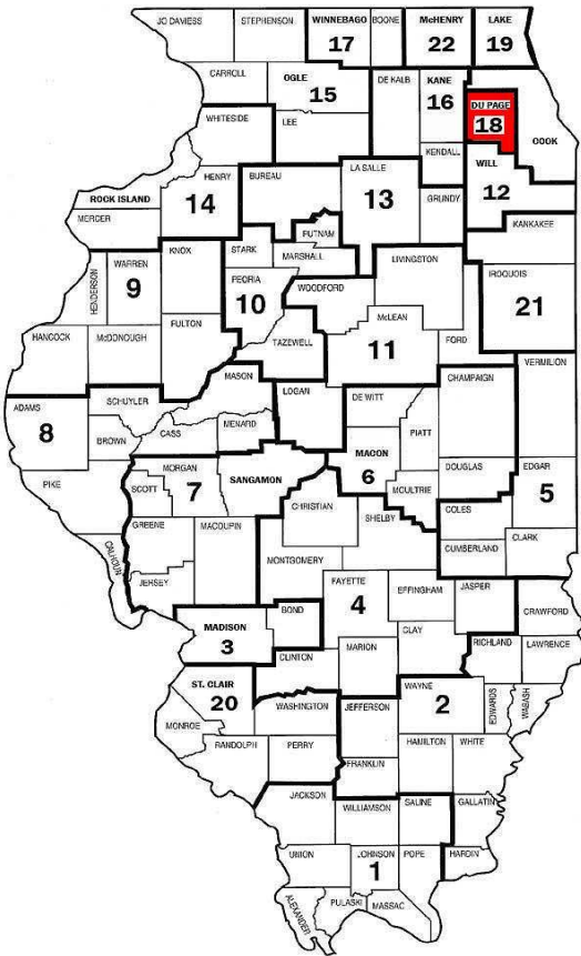
DuPage County Five-Year Disposition Trend

The chart to the left presents information regarding the total number of cases litigated in arbitration which were either resolved during the arbitration process, or ultimately went to trial. From 2005 through 2009, an annual average of 5,286 cases were referred to or are pending in arbitration. Program data indicate that either a settlement or dismissal was reached in 77 percent (3,319 of 4,336 cases were disposed) of the cases filed in the DuPage County arbitration program for State Fiscal Year 2009. This disposition rate is lower than the five-year average of 81 percent and the statewide average of 78 percent.